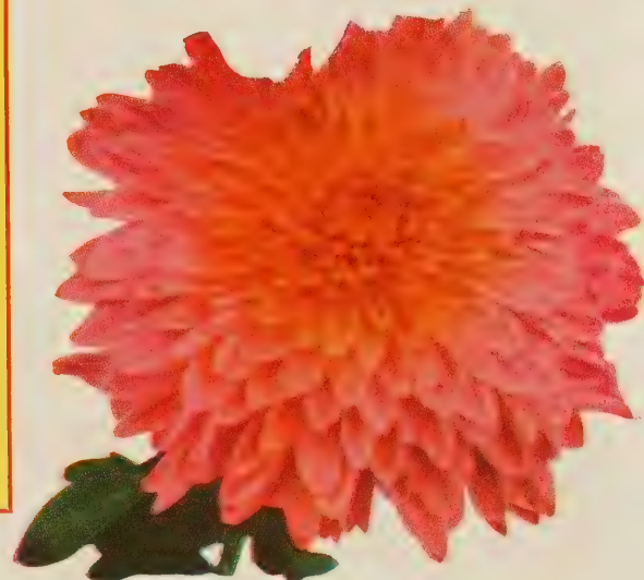
PROFUSE. 60c each; 3 for $1.50

7 EARLY AUTUMN Mums An especially nice selection to come into bloom about mid-September. 7 Sure-to-Bloom Plants $3.60 (1 of each pictured)